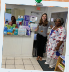
Community Diaper Donation

The Up Center held our first Virtual Job Fair this summer, hoping to bring some enthusiastic, new faces to our expanding team. Over 30 participants visited virtual booths for many of our clinical programs, including Outpatient Counseling, Community Based Counseling, Team Up Mentoring, Foster Care & Adoption, and Marketing and Development.