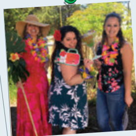
Spring Luau All Hands Meeting