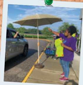
Foster Care Drive-Thru Parade